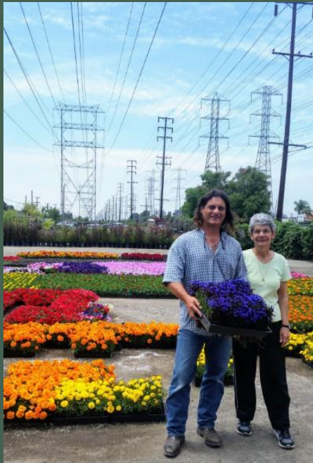
30-60 DAY CROPS