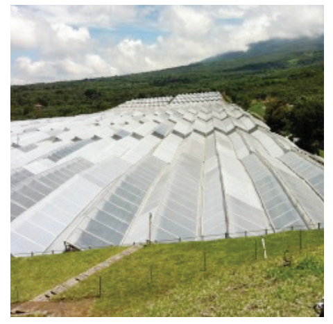
Fig. 2. Fully covered greenhouses with high roofs and the ability to vent hot air from the roof through insect screening.

Herein, we define CEA as the production of