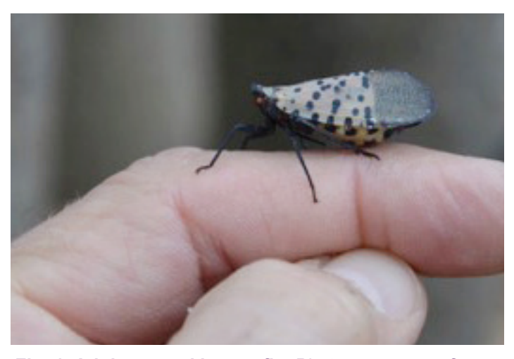
Fig. 1. Adult spotted lanternfly.