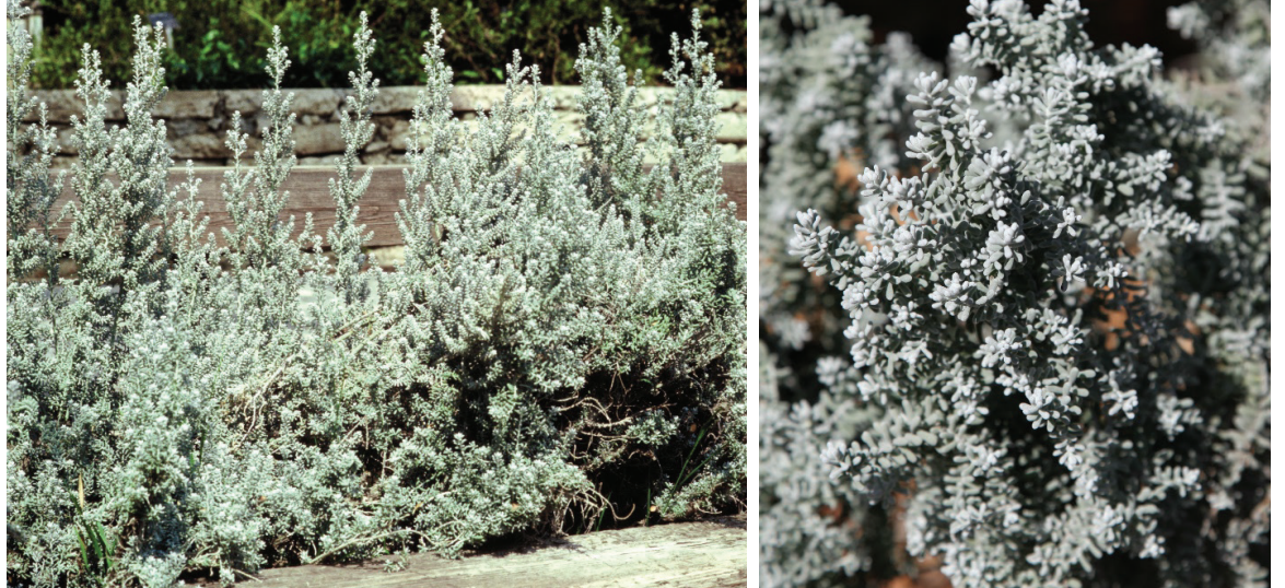
Fig. 3. Maireana sedifolia, pearl bluebush, is a native to the alkali flats of Western Australia and thrives in welldrained alkaline soils. It is a small shrub typically to about 3 feet tall and wide, with uprightgrowing stems (left) and small succulent white leaves (closeup of foliage, right).