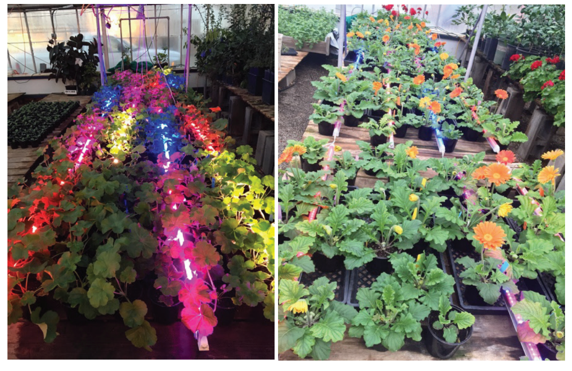
Fig. 1. Test-model systems of geranium (left) and gerbera (right) using LED lighting.

LED lighting technology has already shown many great advantages in controlled environment production. The diversity in spectra, high energy use efficiency, cool operating surface and long life suggest that LED lamps have the potential to become the dominant light source in protected agriculture, particularly in greenhouses or other types of indoor production. While LED lamps had the reputation in the past of being too expensive,