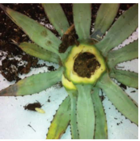
Fig. 3. Potted agave with severe agave weevil damage throughout the growing point. Note the agave weevil pupa to the lower left.

are unsure how well that kind of treatment would work in the landscape. We were able to rear some of the weevils at the Center for Applied Horticultural Research, but we were unable to conduct any trials.