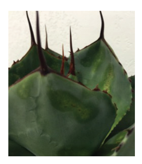
Fig. 4. Eriophyid mite damage on agave. This damage occurred while the leaves were pressed up against the growing point. The brown discoloration is similar to aloe mite damage, but doesn't grow into the gall-like tissues that is typical of aloe mites.

Lastly and more recently, we have received a flurry of calls regarding disease-like damage on agave. When requesting photos (fig. 4), we noticed that the symptoms resembled aloe mite damage and checked the scientific literature for such occurrences on agave. Upon further investigation and confirmation microscopically, we determined that indeed there were eriophyid mites present, and that low infestation levels were present in several locations. Unfortunately, some of the samples contained mites that were causing damage far down into the growing point. Clearly, that damage would not be visible for about a year or until the leaves had flushed out.