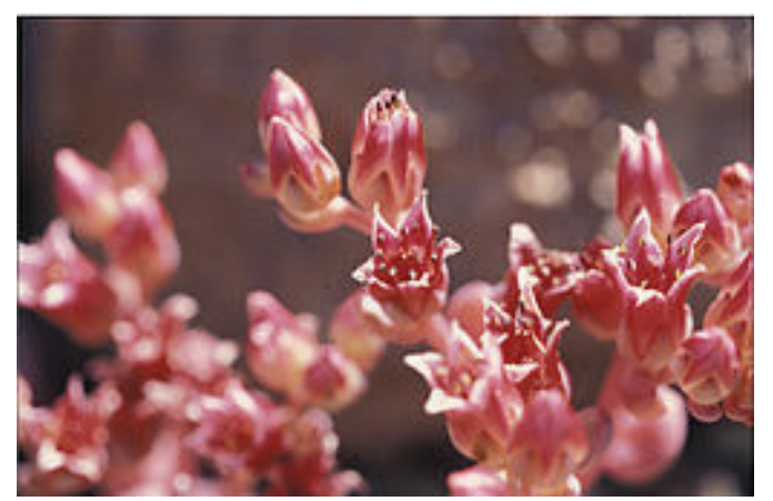
Fig. 2. Sedum laxum ssp eastwoodiae, red mountain stonecrop, is a native to southwestern Oregon and northwestern California. It is rarely available in nurseries, unlike the other plants in our study; it is listed by the California Native Plant Society as a Rare and Endangered Plant and by the Federal Government as Species of Concern. It is a succulent plant forming basal rosettes with leaves up to 1-inch long. Shown is the inflorescence, which is made up of many flowers with reddish or yellowish petals.