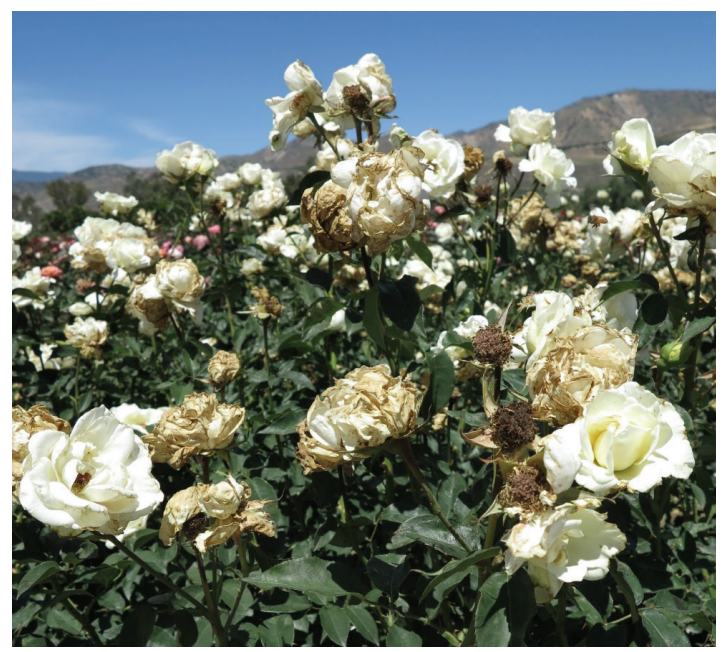
Fig. 3. Botrytis blight rots rose flower buds and turns flower petals brown.

Botrytis is a necrotrophic pathogen and relies on enzymes to rot plant parts. Infected tissues soon turn brown due to enzymatic degradation of the middle lamella, cell walls and cell contents. Evidence also suggests that B. cinerea causes a hypersensitive reaction in plants and programmed cell death by its host plant in response to infection (Williamson et al. 2007).