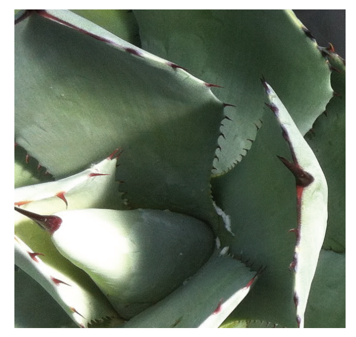
Fig. 1. Agave mealybug at the base of agave leaves. These small potted plants were used in a trial while they were under quarantine.