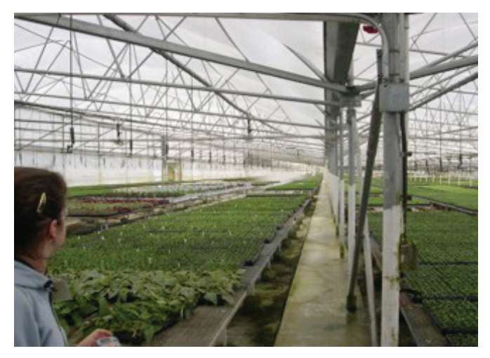
Fig. 3. Semi-automated propagation of cuttings grown in a greenhouse.

agricultural crops under modified, highly controlled conditions in greenhouses or indoor growing spaces using soilless culture (fig. 4), including hydroponics. This type of production can increase the capacity and economic viability of small commercial growers in California, particularly those located in urban and peri-urban (rural–urban transition zone) settings, because of the higher efficiency and lower demand for land and water resources. Clearly, CEA will likely play a critical role in addressing sustainable food