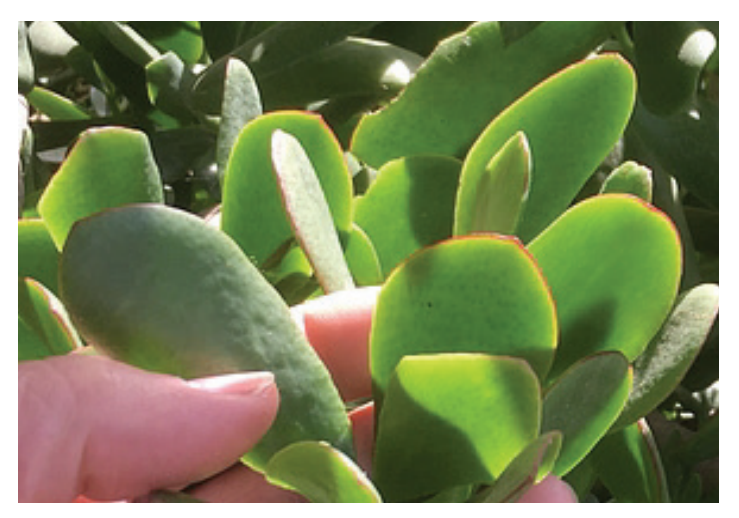
Fig. 1. There are several cultivars available in nurseries that originated from Crassula ovata (jade plant), a native of South Africa. Shown is Crassula ovata 'Big Alice,' a cultivar with 3-inch long glossygreen leaves and a thin margin of red near the tips, growing 3- to 5-feet tall.

Over the past several months our lab has been collecting plant material to represent "wintergrowing" and "summer-growing" succulents that are usually commonly grown in the nursery trade. These terms are used loosely, given that our climate will cause some of these species to grow year-round or perform in different growth cycles than they would normally do in their native habitat. Our goal is to determine nitrogen and water needs throughout a one-year growth cycle, determining if there are differences between winter- and summer-growing succulents.