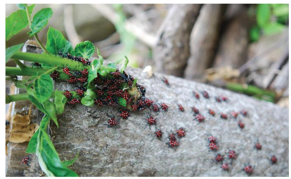
Fig. 2. Spotted lanternfly aggregation on tree bark.

Be on the lookout for this pest. It should be quite obvious when you see them and, as with other invasives, we'd like to detect this one early if we can.