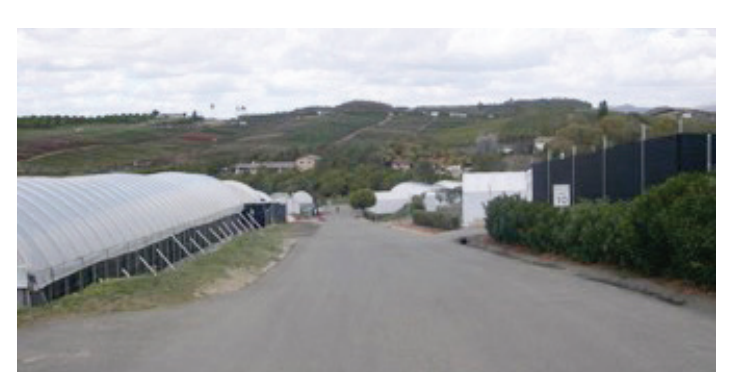
Fig. 1. Fig. 1. Lifted side and open-end hoophouses.

a wooden or metal structure. The latter type of structure with covered plastic is often called a high tunnel or hoophouse (fig. 1) and is, by definition, unheated with no electricity (Cornell 2012). Some do deem this very minimal "control" to be enough to consider hoophouses as part of CEA. Additionally, attempts to grow plants without using direct sunlight have resulted in the development of technologies where plants are grown under lamp light and all growth variables are under some level of control. Such indoor production is also part of CEA.