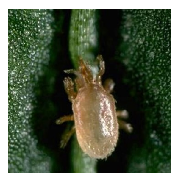
Fig. 3. Adult Hypoaspis miles predatory mite.

Predatory insects. Rove beetle adults, Atheta coriaria, are commercially available, but they are rarely used, probably because of the limited amount of data supporting their performance. There is some concern over whether this predator can be used successfully with predatory mites because it will eat them, but the two are often recommended for use together. At greenhouse temperatures, both A. coriaria and H. miles take 18-20 days to develop from egg to adult, and the adult beetles are relatively long-lived, surviving for months in the greenhouse. The hunter fly, Coenosia attenuata, has moved into many greenhouses (where pesticide sprays are reduced), and they can be seen aggressively feeding on fungus gnat or shore fly adults. (Editor's note: the hunter fly is not commercially available. See Wainwright-Evans 2009 for more information about this common native predator.)