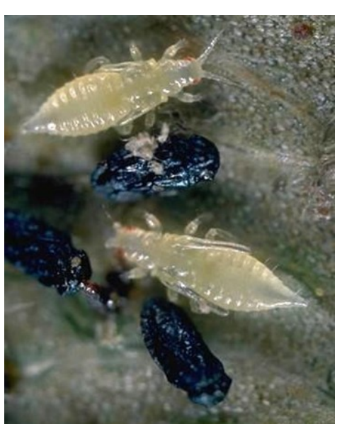
Fig. 6. Healthy greenhouse thrips nymphs, and black nymphs parasitized by Thripobius semiluteus .