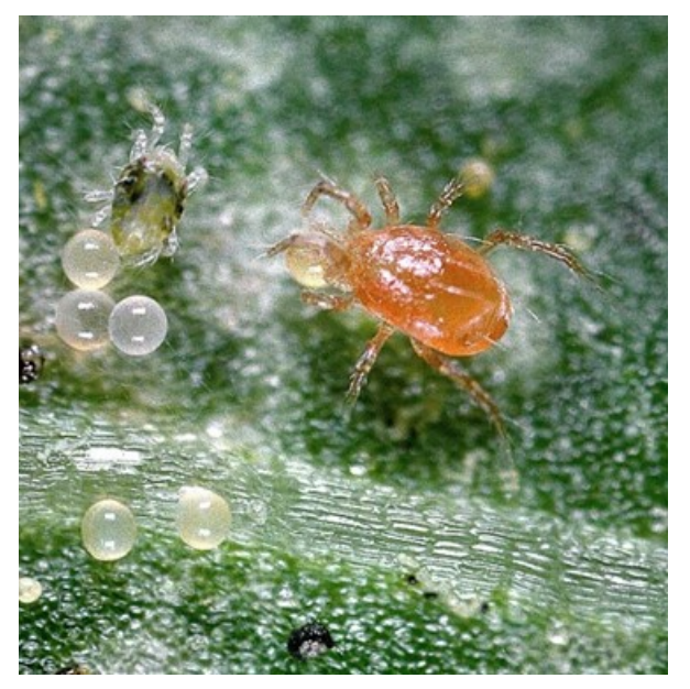
Fig. 5. Phytoseiulus persimilis eating a twospotted spider mite (TSSM) egg. A TSSM nymph and more eggs are to its left. This predatory mite specializes in feeding on web-spinning tetranychids. P. persimilis has unique setae on its dorsal shield that enable it to move through strands of webbing, resulting in rapid increase in predator populations.

logical control agent (fig. 6). Given the gregarious nature of this thrips and its regular use of copious amounts of anal fluid in defense against predation and parasitism, few other natural enemies can provide effective control.