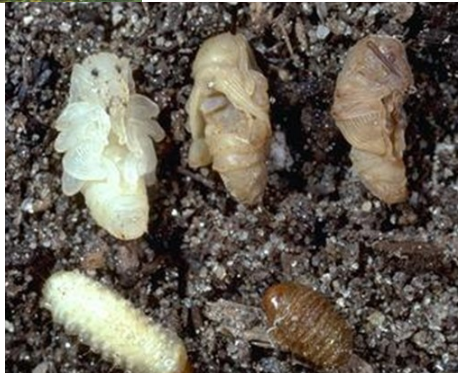
Fig. 7. In left-side photo (A), pupae ( above ) and larvae ( below ) of black vine weevil; the brown ones are infected with the parasitic nematodes, Steinernema feltiae . The right-side photo (B) shows a Diapres root weevil killed by entomopathogenic nematodes.