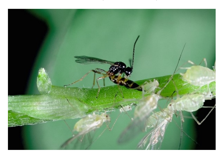
Fig. 1. Adult Aphidius parasite searching out and stinging pea aphids.

Entomopathogenic fungi . Isaria (=Paecilomyces) fumosoroseus, is a microbial insecticide sold under the name PFR-97 20% WDG. This product is registered for all greenhouse ornamental plants to control aphids and several other arthropods. Beauveria bas siana can also be used (see whiteflies).