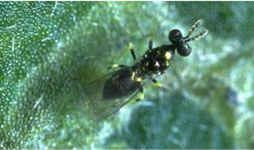
Fig. 4. Adult female Diglyphus sp. on chrysanthemum. The female adult stings host larva to paralyze it, then she lays one or more eggs on the late instar leafminer larva.

Hymenopteran parasitoids . Diglyphus spp. wasps (fig. 4) are natural enemies that can be used to manage leafminer species within the genus Liriomyza . Growers who produce gerbera cut flowers commonly use D. isaea for leafminer control. Initially released when the plants are young and when leafminers are first observed, this natural enemy gradually builds up and can provide control through the life of this two-year crop.