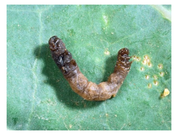
Fig. 2. This caterpillar (cabbage looper larva) died from infection by Bacillus thuringiensis (Bt). This naturally occurring insect pathogen is commercially available as a highly selective insecticide that kills only caterpillars and will not harm parasitoids that attack moth larvae and eggs.

Hypoaspis (= Stratiolaelaps ) miles and the rove beetle Atheta coriaria , have also been effective in controlling this pest. Thus these natural enemies could possibly be effective on other caterpillar pests that are not invasive species in greenhouses and nurseries.