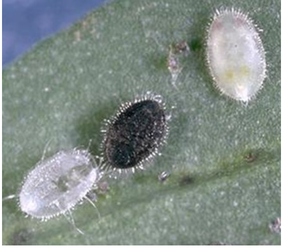
Fig. 8. In the upper-side photo, Encarsia formosa is parasitizing a greenhouse whitefly nymph. The lower photo shows a greenhouse whitefly pupa ( right ), empty pupal case ( left ), and black pupa parasitized by Encarsia formosa ( center ). Black parasitized pupae are collected and glued onto cards that are commercially available; these cards are attached to plants for biological control.

Predatory mites . The advent of the Amblyseius swirskii , which feeds on eggs and very early instars, is a promising addition to biological control in the greenhouse. Many growers make use of this predator to